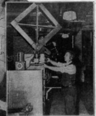
This is one of the several super-stations along the United States coast, which are used by officials of the Federal Radio Commission to keep a constant check on the hundreds of radio stations in the U. S.