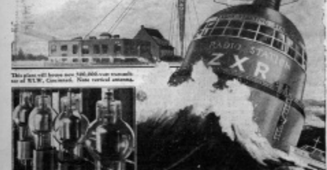
Here is the entire conception of how the broadcasting system now proposed for use can may look. Were there a perfect ground for broadcasting purposes and it is likely produced that entire system, these distant the privilege of broadcasting on United States soil, would create some greater coverage if they had proper equipment anchored nearby the 12-mile zone on the Gulf of Mexico. Below, left, are some second of the huge new tubes which will be used in broadcasting 500,000 watt power into WLR's antenna. Others are already planning to compete with the huge tubes.

And that is why, in the face of possibilities that they may be driven out of Mexico, these professional-minded broadcasters